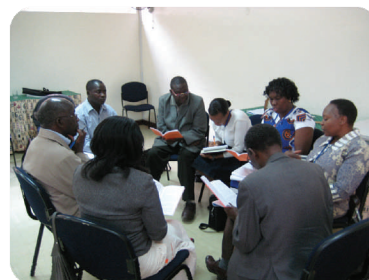
MCK Group Class Discussion

Since 2005, Servant Leadership courses have been held in Nairobi, Malindi, Kisumu, and finally returning to Nairobi.